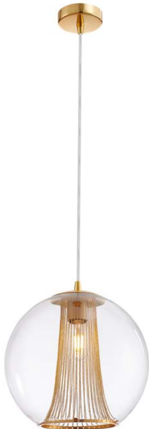
2881-1P D250*H1200 1*E27*60W, excluded metal, glass